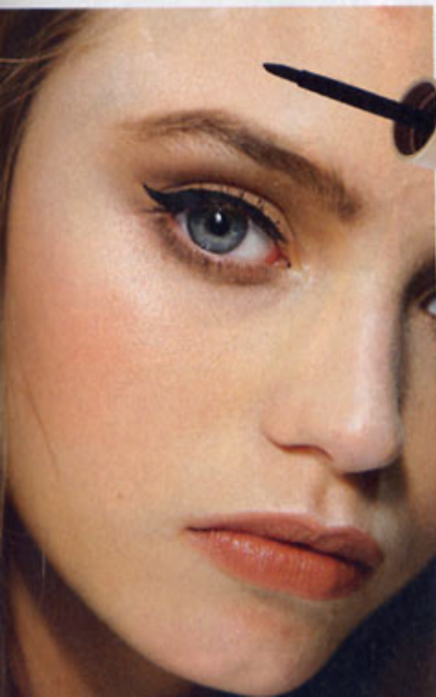
Try: 12 L'Oreal Paris Telescopic Liquid Eyeliner $23.95

"To hide dark circles, take a yellow-based concealer, a shade lighter than your natural skin tone, and dab it gently under the eye area. For puffy eyes, use a concealer a shade darker than your natural skin tone to shadow the puffiness." Try: 13 Sheer Cover Duo Concealers $29.95