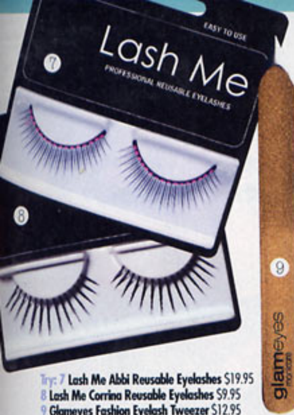
Try: 7 Lash Me Abbi Reusable Eyelashes $19.95 8 Lash Me Corrina Reusable Eyelashes $9.95 9 Glameyes Fashion Eyelash Tweezer $12.95