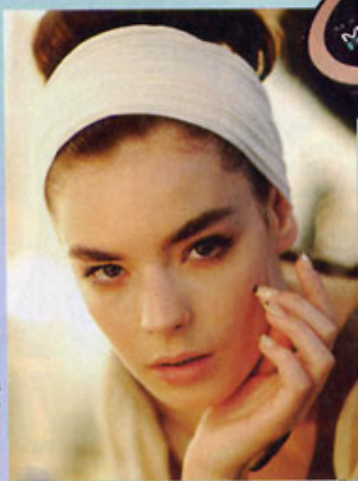
Try: 10 Maybelline New York Mineral Power Powder Foundation $24.50 11 Maybelline New York Mineral Power Natural Perfecting Foundation $19.95

"Take a little foundation and apply it all over with your fingers, starting from the nose and working your way out towards the hairline. Use a brush to apply a touch more to the T-zone, around your nose, lip area, hairline and under the chin. Finally, take a foundation powder and lightly dust it all over your face."